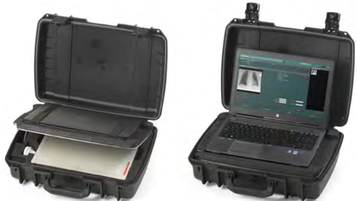
Transportable MUSICA® DR Suitcase for 10x12" detector and laptop empowered with MUSICA® workflow.

Your DR detector investment can be used for multiple X-ray systems, including those you buy in the future. With no cables, the wireless detectors can be switched and transported easily due to their compact design and light weight.