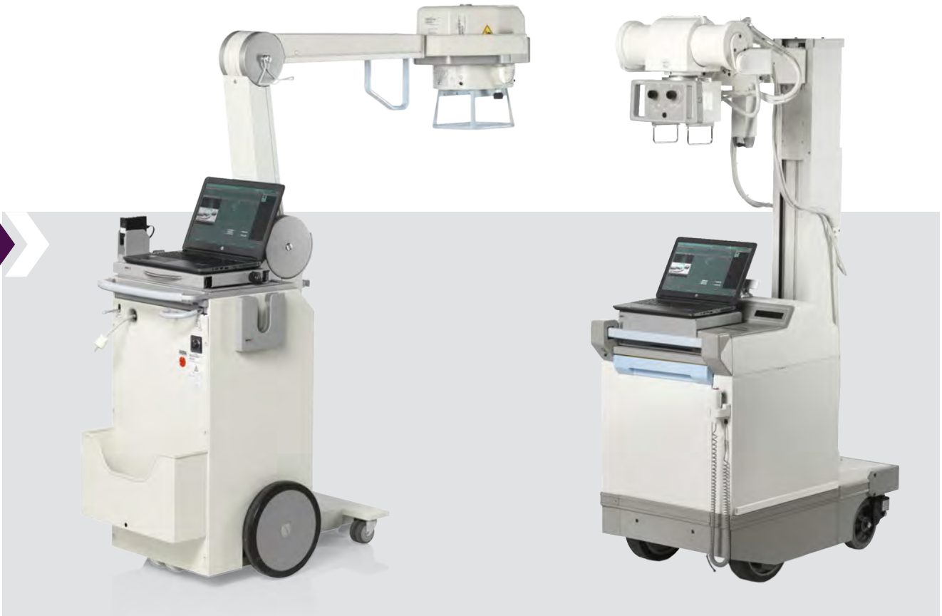
Mobile DR Retrofit for GE-AMX with non-invasive mounting kit (Docking & Locking) for laptop.